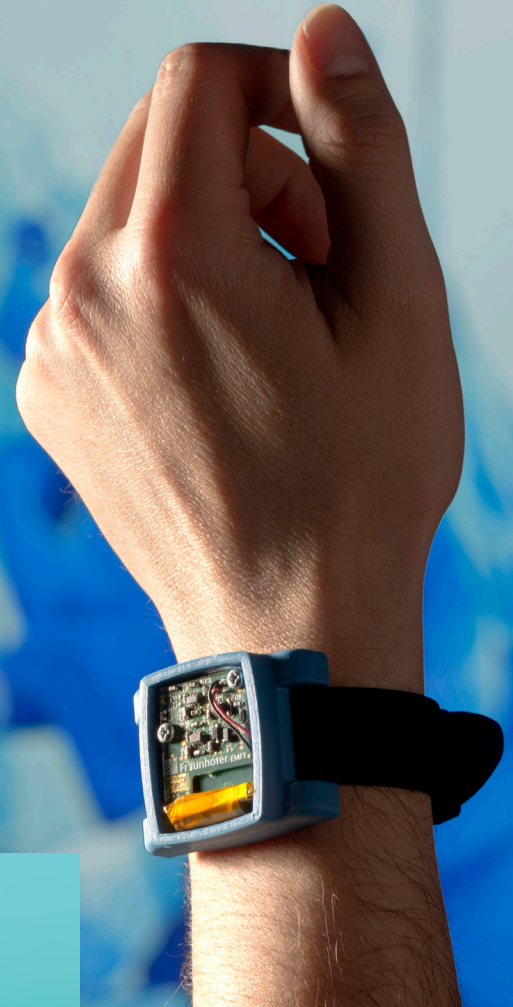
Medical wearable: Sensor bracelet for vital parameter measurement and health monitoring.